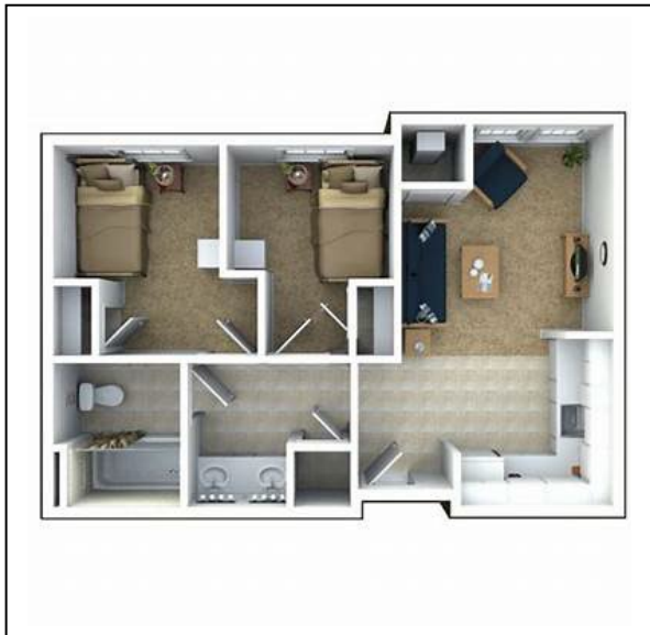
Two Bedroom Suite – 592 Square footage