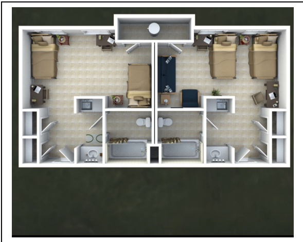
Double Occupancy – 422 Square footage