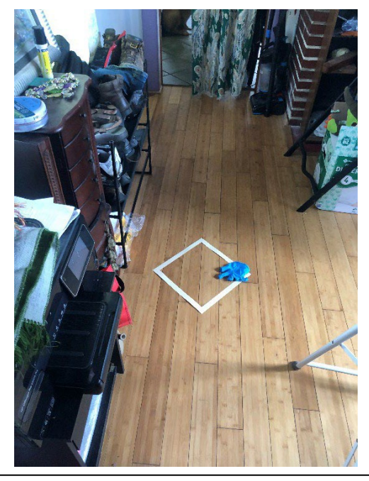
Photograph #8 Location: Room 4 Item #'s: 48 Description: Floor Activity: Specialized Cleaning

Photograph #7 Location: Room 3 D-side Item #'s: 47 Description: Window Sill Activity: Specialized Cleaning