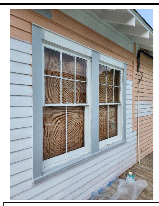
Photograph #26 Location: Exterior B-side Item #'s: 34 Description: Window Casing 5 Activity: Paint Removal, Prime and Paint to match

Photograph #25 Location: Exterior B-side Item #'s: 31,32,33 Description: Window 4, Window Casing 4, Window Sill 4 Activity: Paint Removal, Prime and Paint to match