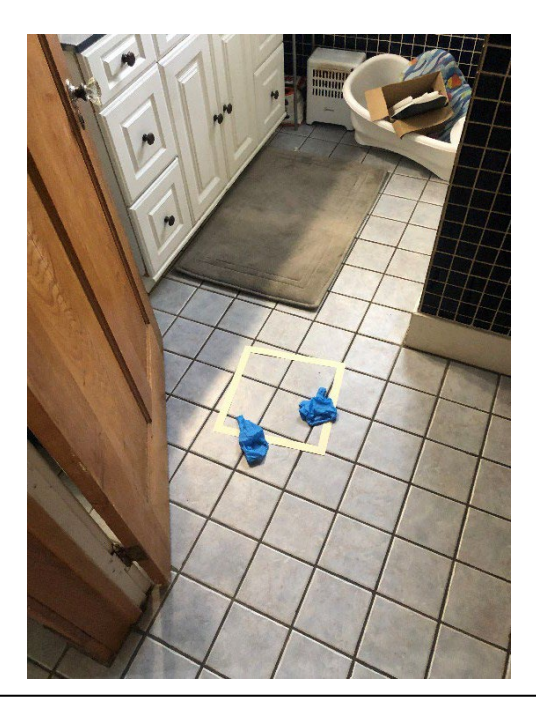
Photograph #6 Location: Room 3 Item #'s: 46 Description: Floor Activity: Specialized Cleaning

Photograph #5 Location: Room 2 B-side Item #'s: 45 Description: Window Sill Activity: Specialized Cleaning