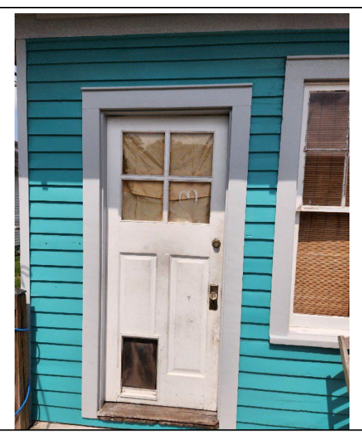
Photograph #28 Location: Exterior C-side Item #'s: 36 Description: Door Activity: Paint Removal, Prime and Paint to match

Location: Exterior C-side Item #'s: 35 Description: Window Activity: Paint Removal, Prime and Paint to match